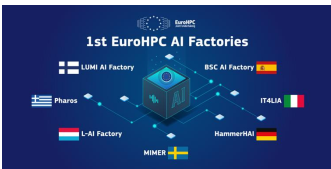
Figure 4: Map of European AI Factories selected in 2024

2024 was a very busy year for EuroHPC in terms of procurement and infrastructural development. Across the areas of high-performance computing, Artificial Intelligence (AI) and quantum computing new procurements and partnerships were launched with a view to providing the European Union with an advanced, resilient HPC ecosystem.