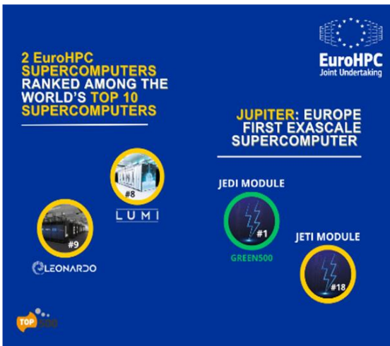
Figure 1: EuroHPC Top500 highlights November 2024

In 2024, the EuroHPC Joint Undertaking continued to provide compute time for European researchers on the following systems: Leonardo, LUMI, Vega, MeluXina, Karolina, MareNostrum 5, Discoverer and Deucalion. The deployment of Jupiter, Europe’s first exascale computer, based at the Jülich Supercomputing Centre in Germany, is progressing at pace, reaching a major milestone in 2024 with the completion of JETI, the second module in this groundbreaking system.